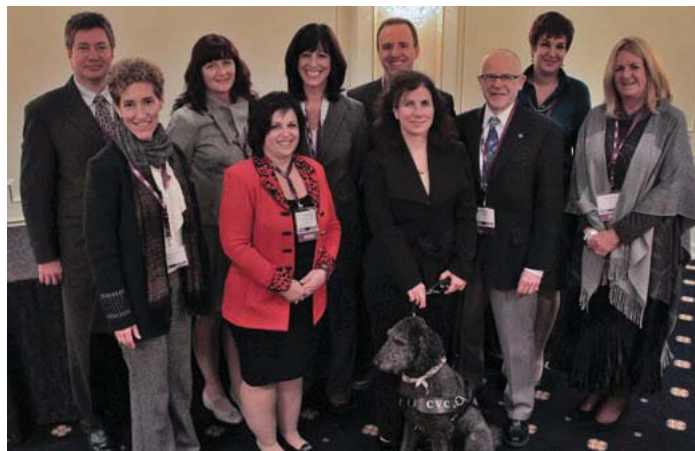
Facilitators of Day One working group sessions