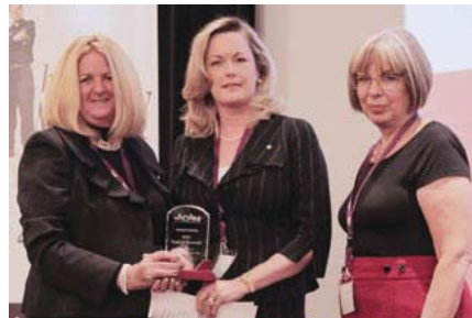
Large Employer of the Year BMO Financial Group