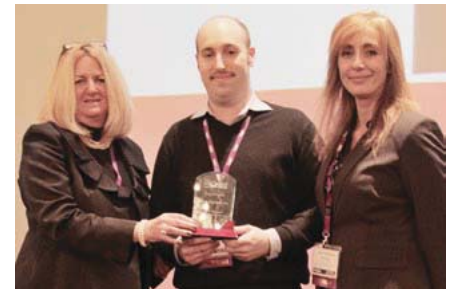
Medium Employer of the Year Aroma Espresso Bar