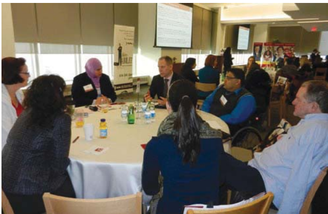
Attendees had the opportunity to discuss one key question about the importance of a Employee Resource Group (ERG) and then shared with the rest of the group