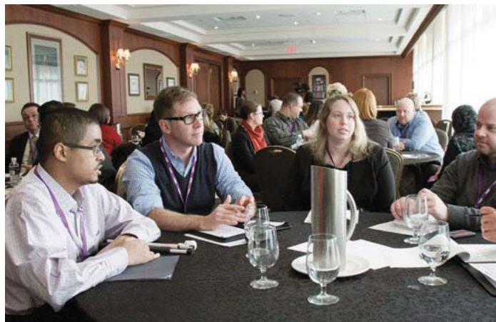
Delegates spent Day One addressing different aspects of work place inclusion

Post event surveys were sent out to all delegate. Workshops were rated higher than ever before. Here is a sampling of the results: