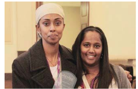
Small Employer of the Year Lick's Home Burgers

The 2011 Ontario JOIN Annual Employer of the Year Awards.