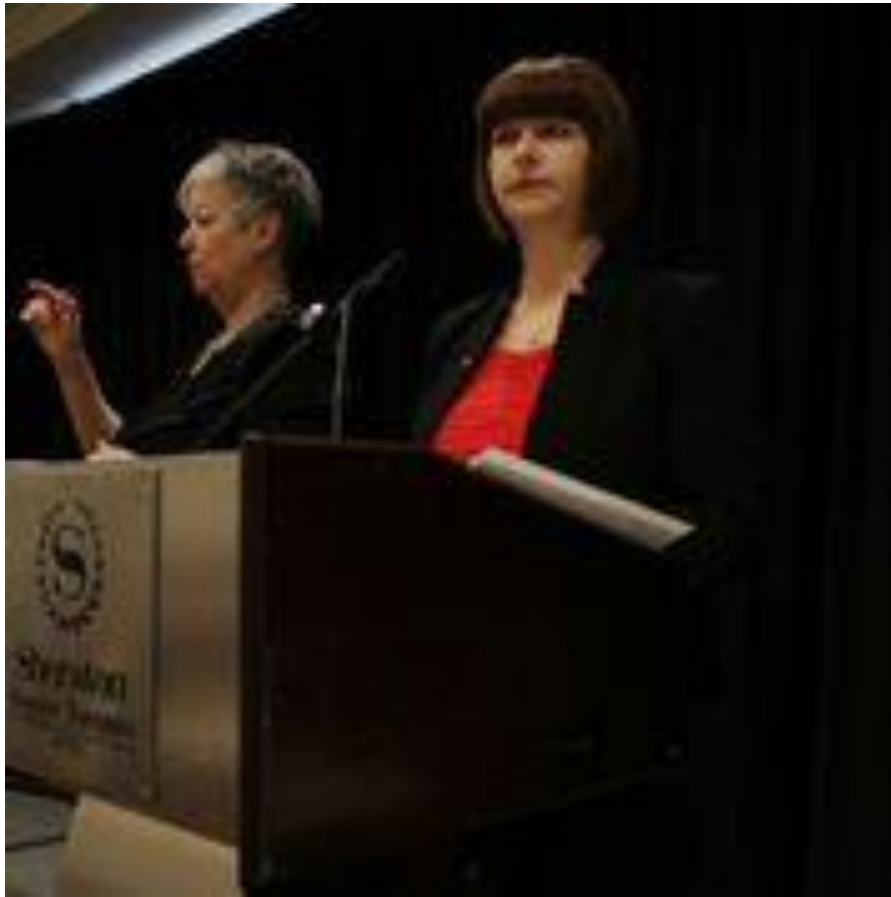
Marie-France Lalonde speaks while an interpreter signs