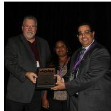
Employer of the Year – AGI Shorewood Group