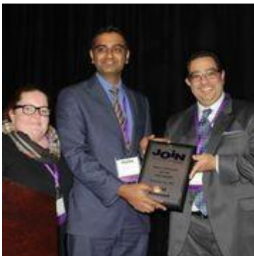
Employer of the Year – SIGNS Restaurant