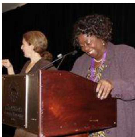
Hon. Jean Augustine with the interpreter